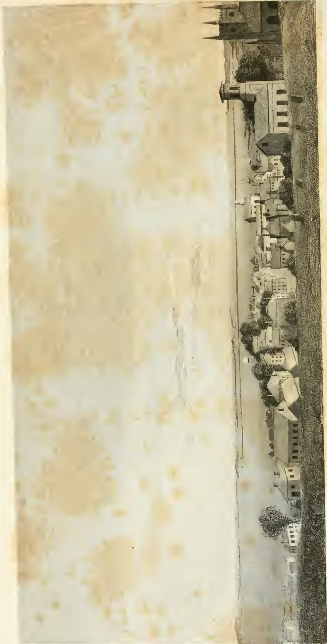
Plymouth from the Burying Hill